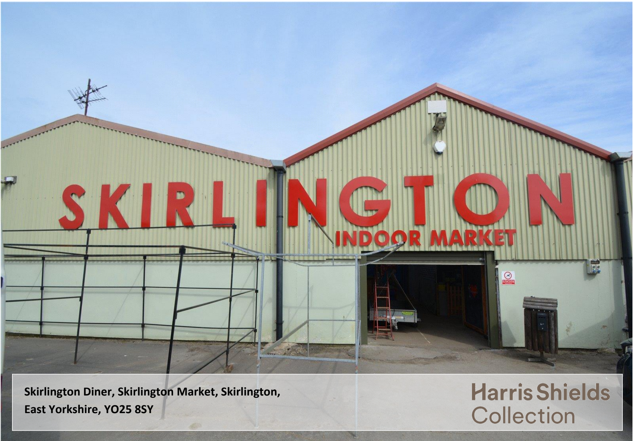
Skirlington Diner, Skirlington Market, Skirlington, East Yorkshire, YO25 8SY